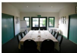
40 Delegates / Boardroom

We also have a Private Meeting Space, located on the Ground Floor of the Main Building for Smaller Corporate Functions, hosting its own Private Balcony.