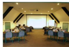
60 Delegates / Classroom