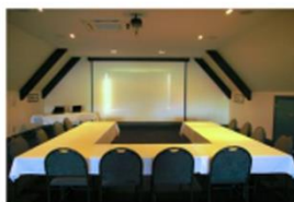
40 Delegates / U Shape