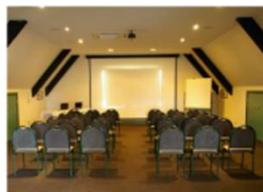
150 Delegates / Theatre Style