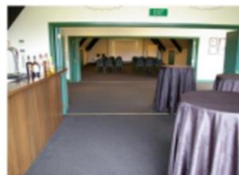
120 Delegates – Banquet Dining